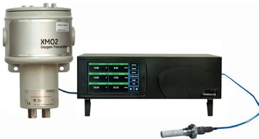
The XMO2 output may be used as an input to the Panametrics moisture.IQ analyzer for simultaneous measurement and display of both moisture and oxygen content.