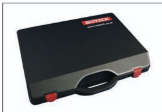
931-22-100 Optional Carrying Case