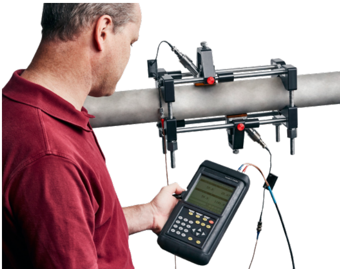
Optional pipe wall thickness gauge

Pipe wall thickness is a critical parameter used by the TransPort PT878GC flowmeter for clamp-on flow measurements. The thickness-gauge option allows accurate wall thickness measurement from outside the pipe.