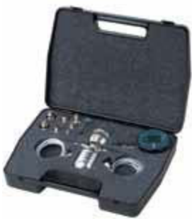
Low pressure pneumatic test kit

Refer to the PV hand pump datasheets for further information.