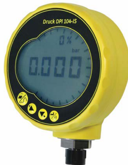
Hazardous Area pressure gauge