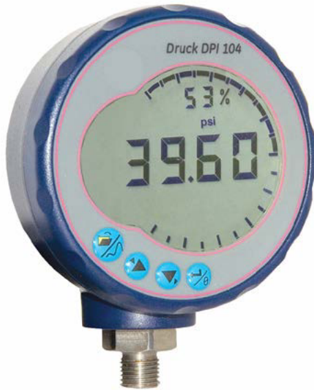
Safe Area pressure gauge