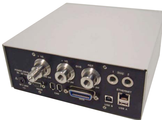
PACE Tallis from the rear

Tallis will be supplied with appropriate standard compliance labelling (STD). Additional regional specific labelling may also be made available as required