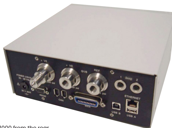
PACE1000 from the rear